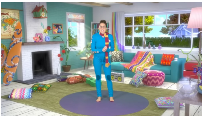
Harry Potter Cosmic Yoga

https://www.youtube.com/watch?v=C52wOlqkw2s