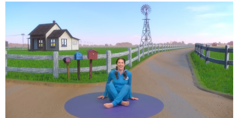
The Wizard of Oz cosmic Yoga

https://www.youtube.com/watch?v=C52wOlqkw2s